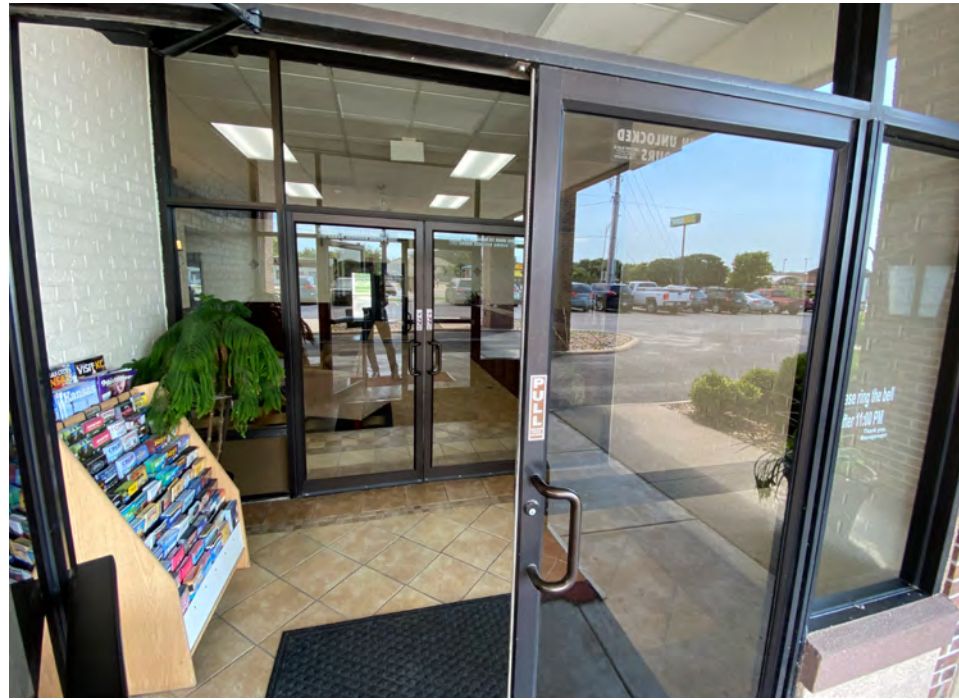
Clean Well-Maintained Hotel - Hesston, KS